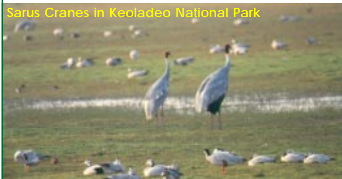
Sarus Cranes in Keoladeo National Park

The United Nations, governments and many non-governmental and private sector partners are planning a wide range of events and activities for the International Year of Freshwater, which is being jointly coordinated by the UN Department of Economic and Social Affairs and the UN Educational, Scientific and Cultural Organization (UNESCO).